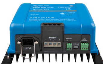
Smart IP43 Charger 12/50(3)