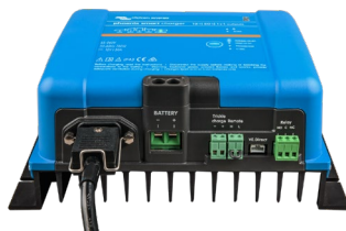
Smart IP43 Charger 12/50(1+1)