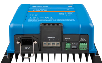
Phoenix Smart 12/50(3)