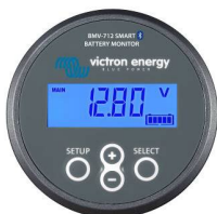
Bluetooth sensing: BMV-712 Smart Battery Monitor