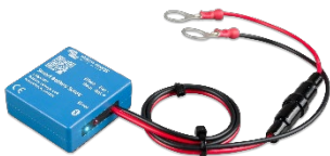
Bluetooth sensing: Smart Battery Sense