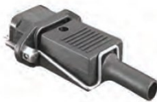
Retainer clip (included)