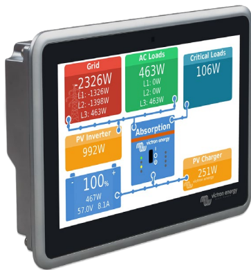
Ekrano GX front and back