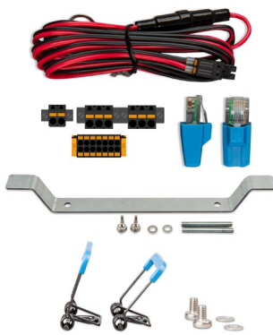
Accessories included with the Ekrano GX